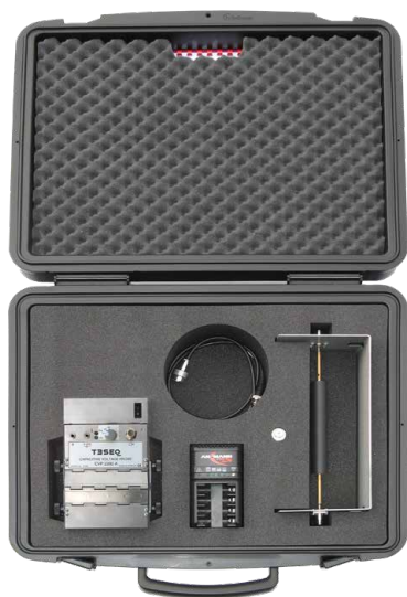
CVP 2200A, battery charger, calibration jig, RF cable and 50 \Omega termination in suitcase