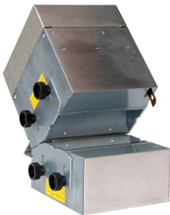
CVP 2200A, opened

The Capacitive Voltage Probe (CVP) is designed for measuring asymmetrical disturbances on cables with capacitive coupling principle. It gives the opportunity to do the measuring without disconnection of the tested cable ("in-situ") and it avoids the influence of the transmission. Main parameter of the CVP is the coupling factor, measured in a calibration system with 50 Ω impedance. The capacitive voltage probe is specified in chapter 5.2.2 and Annex G of CISPR 16-1-2.