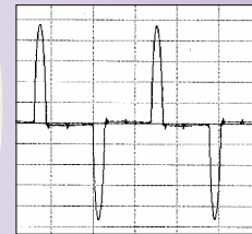
Current waveform of the inverter (primary side)