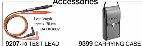
9207-10 TEST LEAD